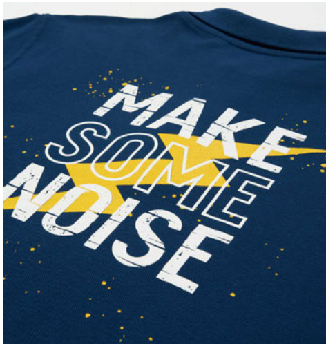
DIRECT TO GARMENT