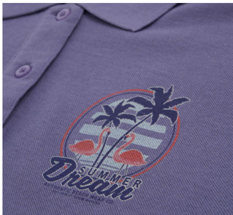
DIRECT TO GARMENT

We have created a series of handy print guides for you, each providing information on the compatibility of polos with various embellishment methods.